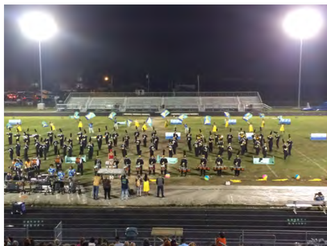
The UNCP Marching Band performing an exhibition for all Brunswick County high schools (October 2015)

The UNCP athletic bands have been very busy over the past year! In November 2015, after finishing a successful season of marching their halftime show, “Life’s A Beach,” the “Spirit of the Carolinas” Marching Band took to the road! The band spent a day learning about history and culture in Washington, DC before traveling to Norfolk, VA to participate in the Grand Illumination Parade. Using fiber optic glow sticks as plumes, along with lights on the drums and rifles, the SOTC had a wonderful time marching through downtown Norfolk.