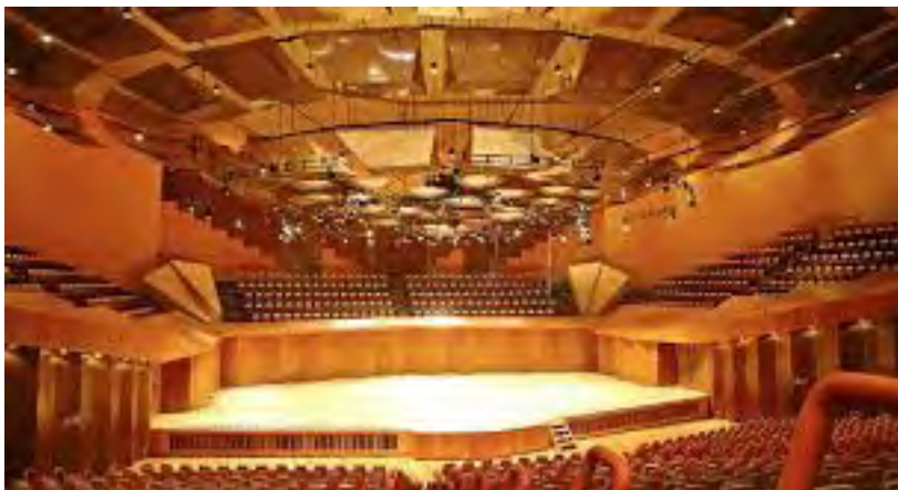
Sala de Concertos Nezahualcoytl (concert hall at the University of Mexico)