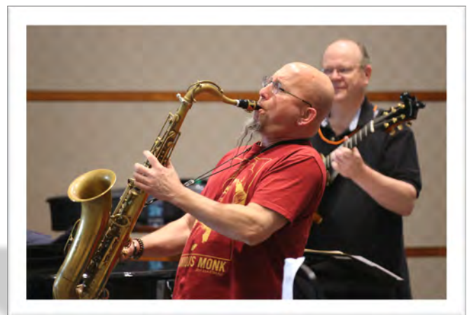
2016 Jazz Festival guest Jeff Coffin giving a clinic at UNCP