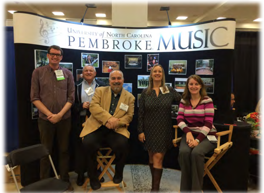
The UNCP music booth at the 2015 North Carolina Music Educators Association (NCMEA) conference