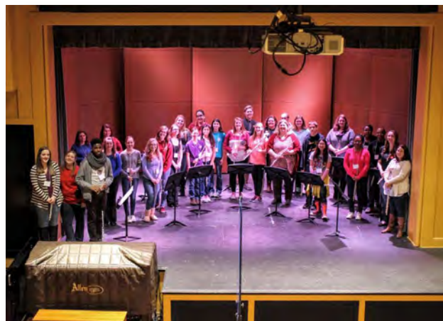
Participants at UNCP Flute Day, February 2016