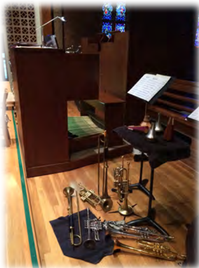
Trumpet recital in Bristol, Tennessee in March 2016

I performed in a two trumpet and organ recital in Bristol, Tennessee in March 2016.