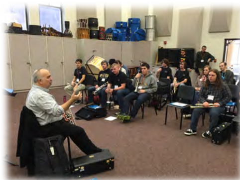
Trumpet masterclass at 2016 UNCP Honor Jazz Festival