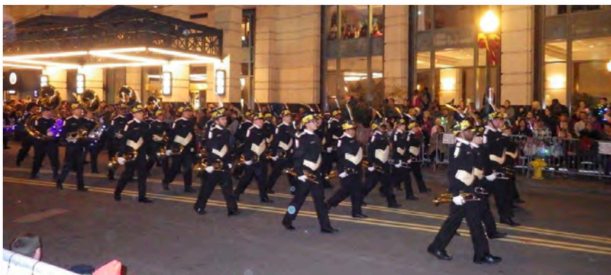
“Spirit of the Carolinas” marches in the Grand Illumination Parade in Norfolk, VA

The UNCP athletic bands have been very busy over the past year! In November 2015, after finishing a successful season of marching their halftime show, “Life’s A Beach,” the “Spirit of the Carolinas” Marching Band took to the road! The band spent a day learning about history and culture in Washington, DC before traveling to Norfolk, VA to participate in the Grand Illumination Parade. Using fiber optic glow sticks as plumes, along with lights on the drums and rifles, the SOTC had a wonderful time marching through downtown Norfolk.