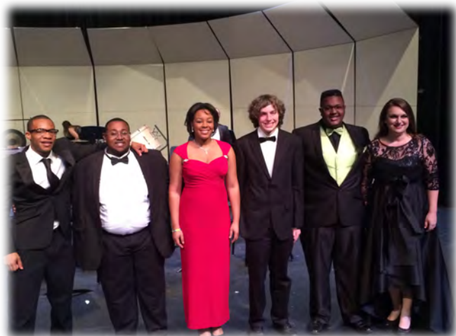
UNCP Concerto Competition winners who performed with the UNCP Concert Band and Wind Ensemble in GPAC (March 2016)