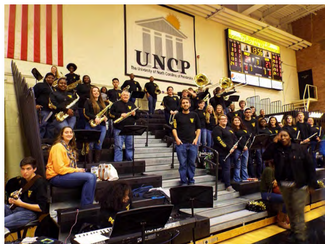
2016 Pep Band

During basketball season in the spring of 2016, the pep band continued its tradition of cheering on the men’s and women’s basketball teams. The 35-member group kept the beat going as they helped the men’s team to an overall winning record of 15-13 and kept the women’s team upbeat as they finished 10-16 for the season.