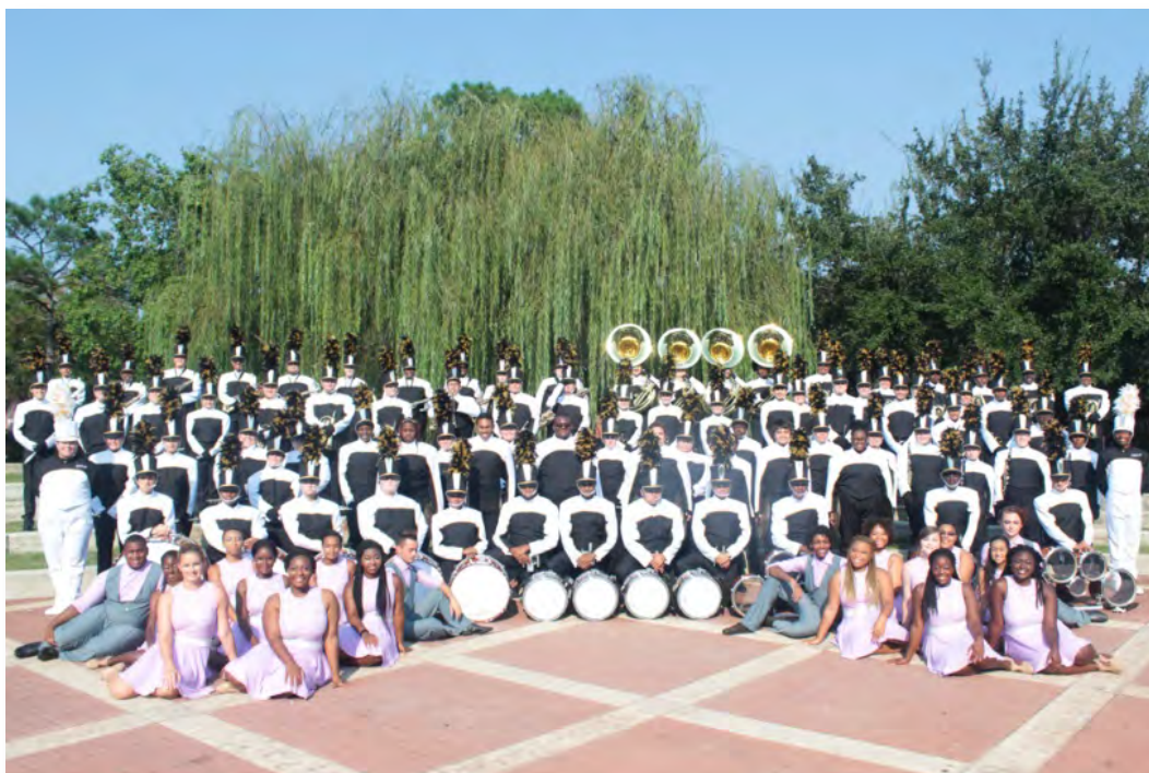
The 2016 “Spirit of the Carolinas” debuts their new uniforms