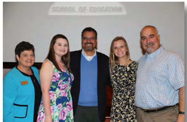
Music Education Pinning Ceremony, May 2016