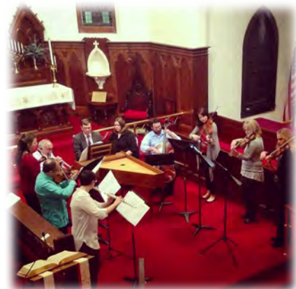
Brandenburg Concerto No. 2 performance

I also got to play Brandenburg Concerto No. 2 with players from Fayetteville Symphony in January 2016. This is one of the most difficult works for trumpet because of the ridiculously high range.