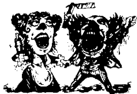
Sweeney Todd, The Demon Barber of Fleet Street

The performances are open to the public. Tickets are $3.00. Call the Music Office at 521-6230 with any questions.