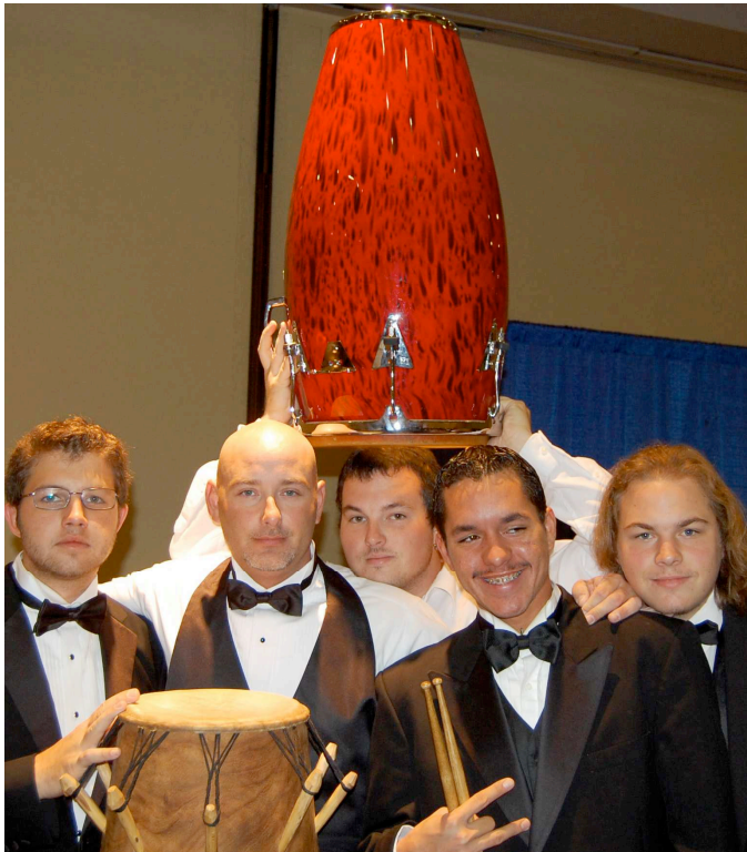
UNCP Percussionists relax at NCMEA Conference.