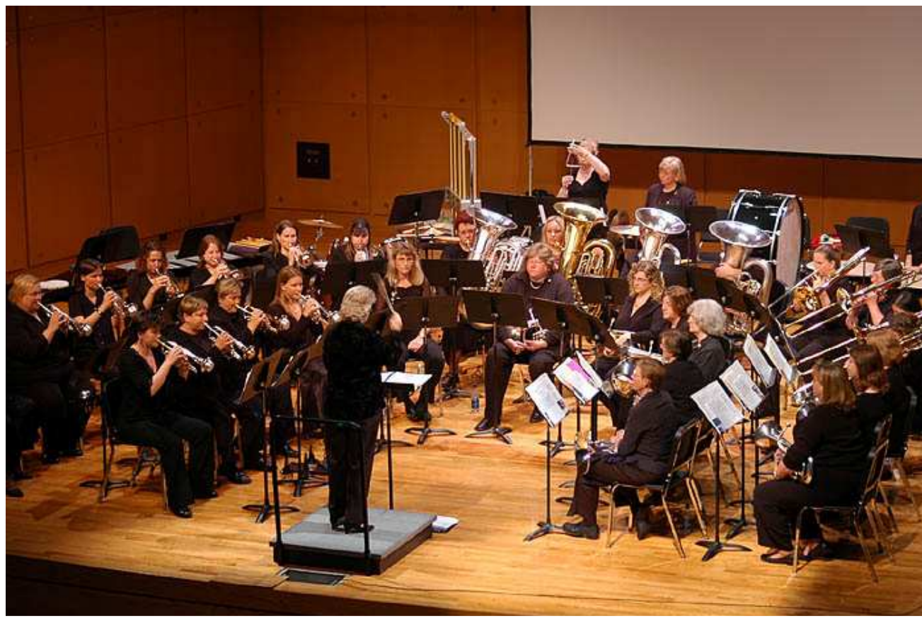
The Athena Brass Band

This July the forty-five piece Athena Brass Band performed as the exhibition band at the Brass Band Invitational at Indiana University Southeast in New Albany, Indiana. The Athena Brass Band is the first modern all-female brass band in the United States, named after Athena, the Greek goddess of wisdom. The band was formed in 2003, and has subsequently performed at the Great American Brass Band Festival in Danville, Kentucky as well as International Women's Brass Conferences in 2003 and 2006. The Athena Brass Band musicians include current or former members of the U.S. Army Band, the U.S. Coast Guard Band, Brass Band of Battle Creek and the New Sousa Band. There are several college professors and public school music educators, conductors, music therapists, a sound engineer, a music publisher and a composer; also a nuclear physicist, a biologist, a sociologist, an MBA and an author. Most of the performers, who live and work across the country, also play with their local North American Brass Band Association band. The mission of the Athena Brass Band is to showcase highly professional musicians, to confront stereotypes, and to change public perceptions of women in brass performance. UNCP's Assistant Professor of Low Brass, Dr. Hersey, has performed with Athena since its inception and looks forward to the next performance in Toronto, Canada in May 2010.