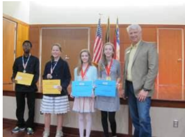
Senior and Junior Naval Awards