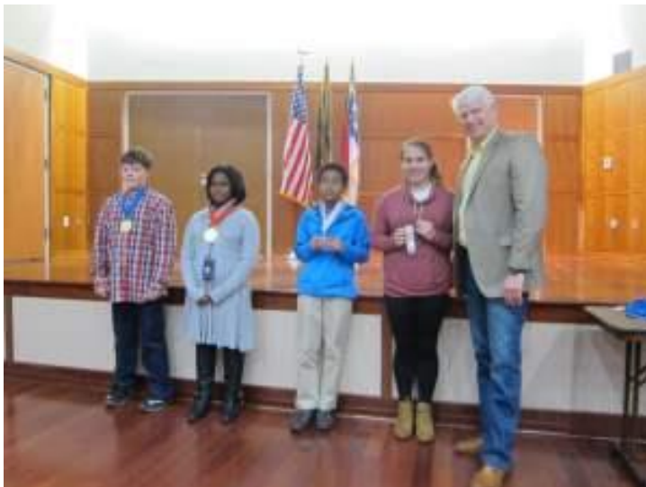
Chemistry Junior Winners