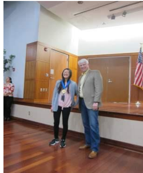
Engineering Junior Winner