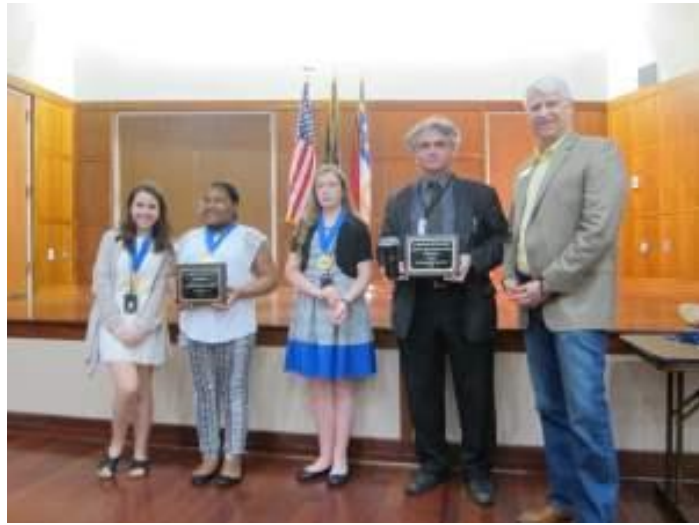
Overall Winner Award