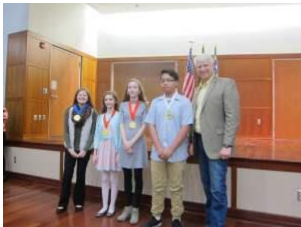
Physics Junior Winners