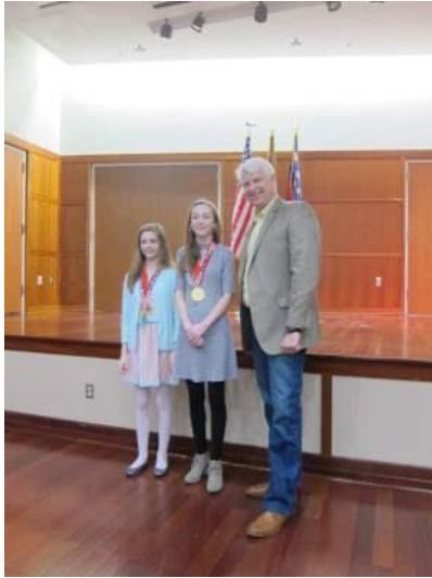
Dr. Dalton Brooks Award