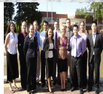
Students in Free Enterprise "Preparing our community for the changing global market One individual at a time."

The Extreme Entrepreneurship Tour (EET) is a nationwide, 50-school tour taking