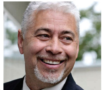
Dr. Ben Chavis