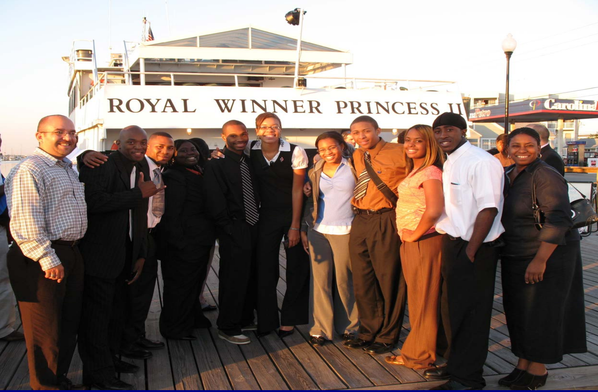
UNCP, Unified Robeson and UNCG Dinner Cruise