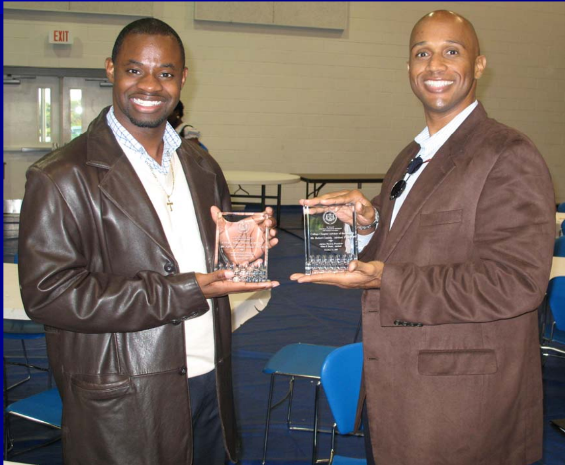
Advisors of the Year Award