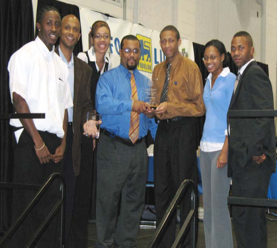
College Chapter of the Year Award