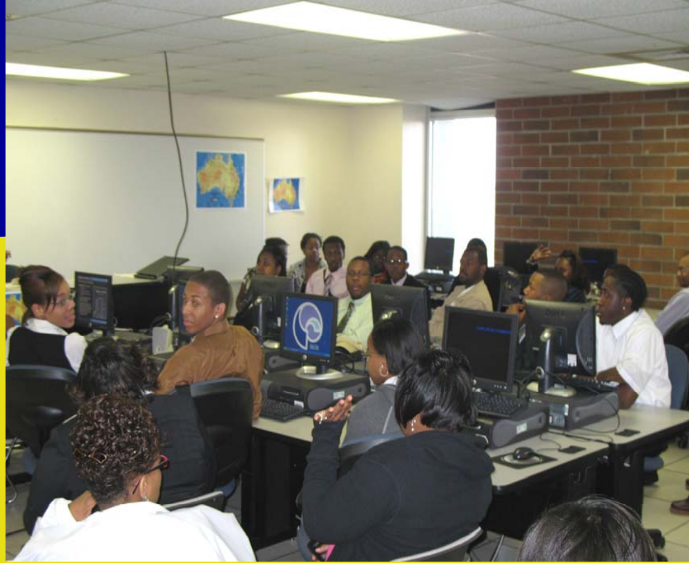
Digital Divide Session