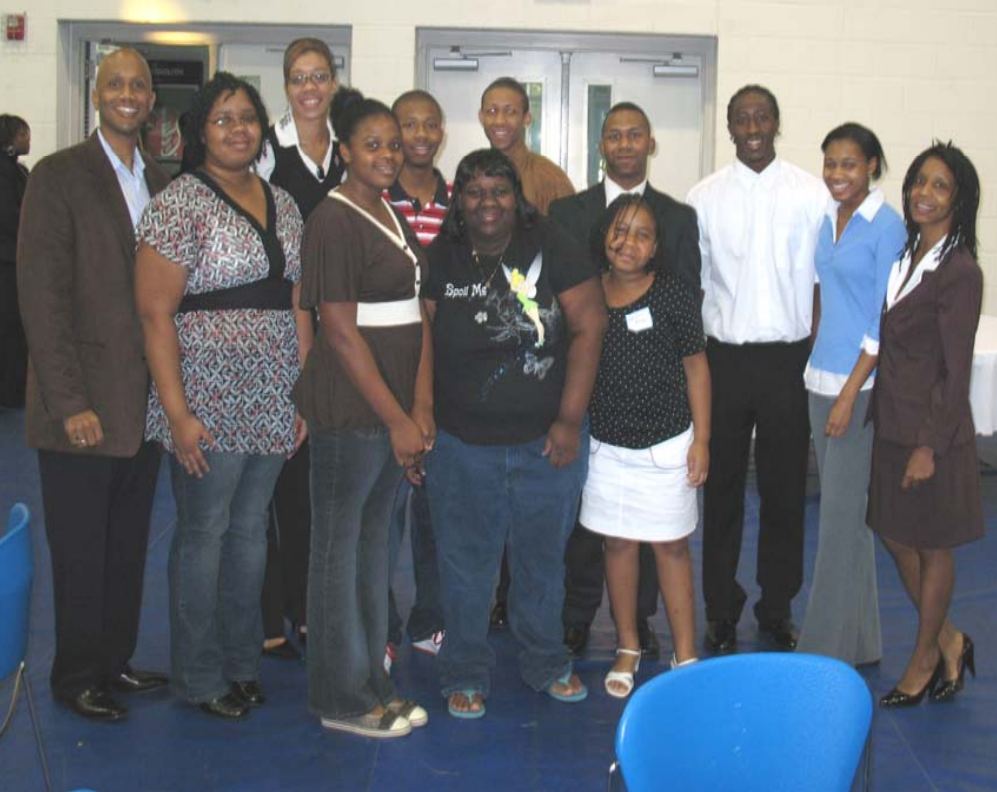
UNCP and Scotland County Chapters