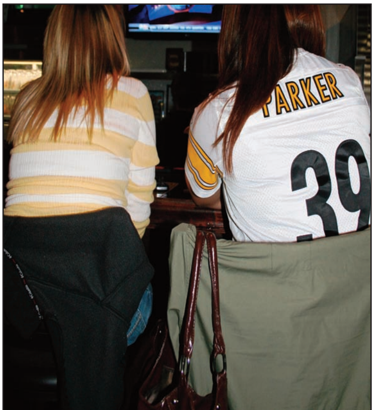
Students enjoy watching the game in the comfortable environment.