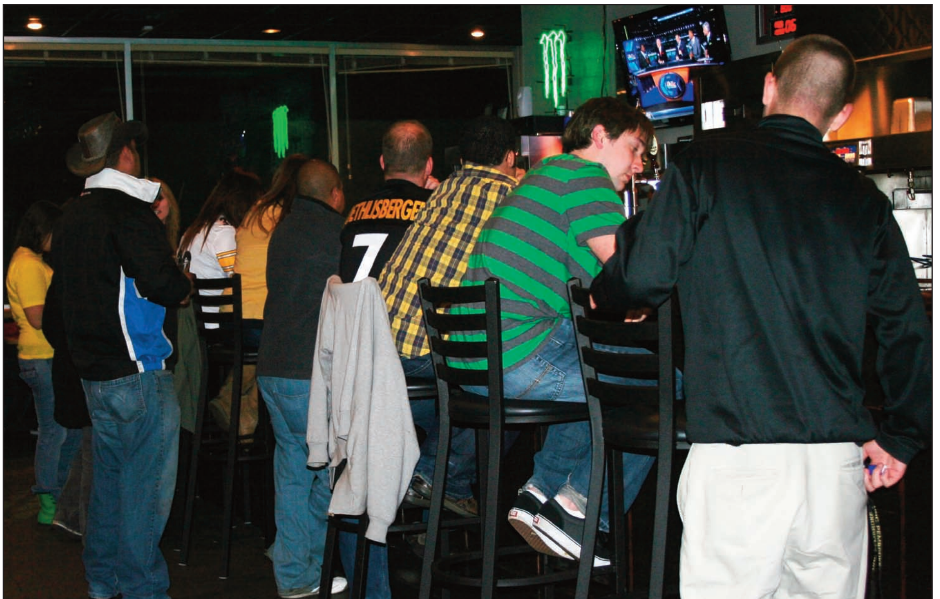
Students and members of the community go to Mighty J's to support their team for Super Bowl XLV. The local sports bar provided a festive atmosphere for people to watch the game.