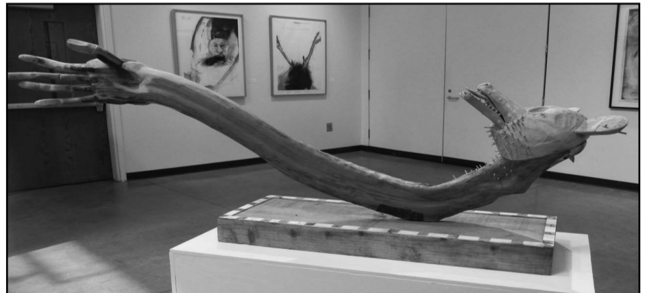
This piece is part of the current A.D. Gallery exhibit by Rick Bartow titled Dog's Journey: A 20 Year Survey.

The A.D. Gallery also hosts various free workshops available to students of any major, but there is limited space. More information about future exhibitions and gallery openings is available at uncp.edu/a.d.gallery .