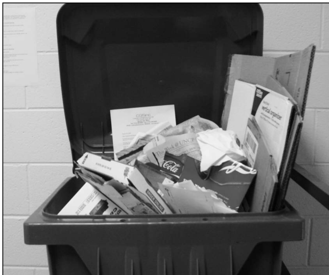
The larger buildings on campus have two or more recycling bins. They are most commonly located on each floor of the building.

The education-based program helps from kindergarten and up, and Apple only helps those