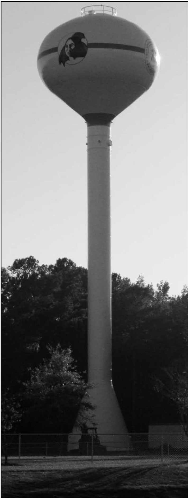
The new water tower on campus was completed in October. The water tower has the Braves logo on one side and the UNCP school seal on the other side. The water tower is located near Village Apartments.

Jackson can be found on Facebook as well as YouTube and has a video blog of various shows she has put on. They can be accessed on her blog at erinjackson.net