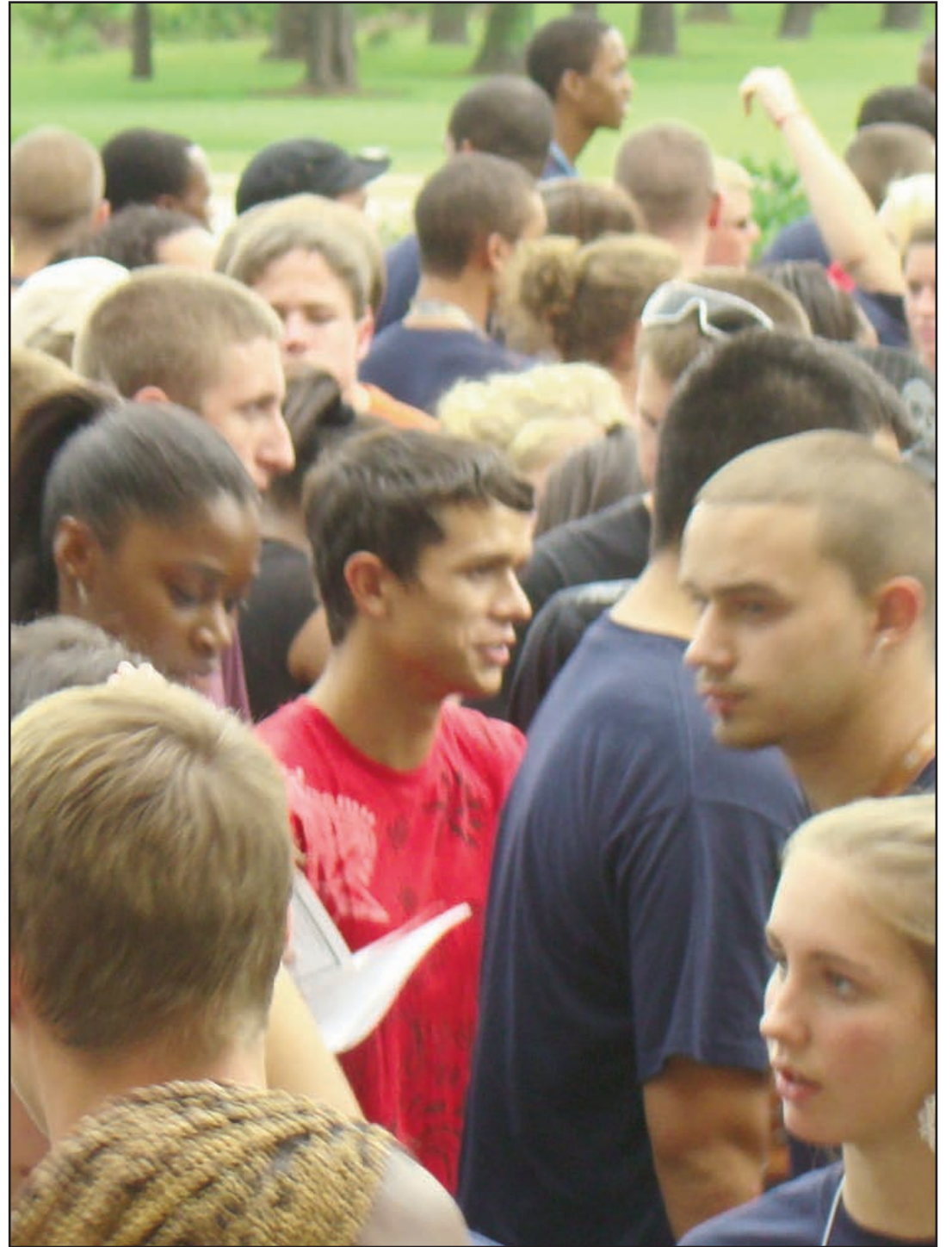
A crowd of freshmen students gather outside of GPAC before freshman orientation. This year, UNCP had its largest incoming freshman class and housing was an issue for the University.