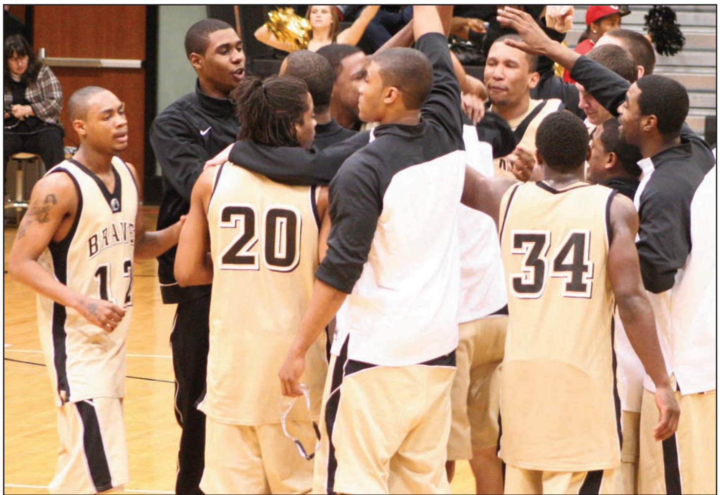
The UNCP men's basketball team huddles before a game. The Braves took down Flagler 92-83 Feb. 6 for their eighth win of the season.