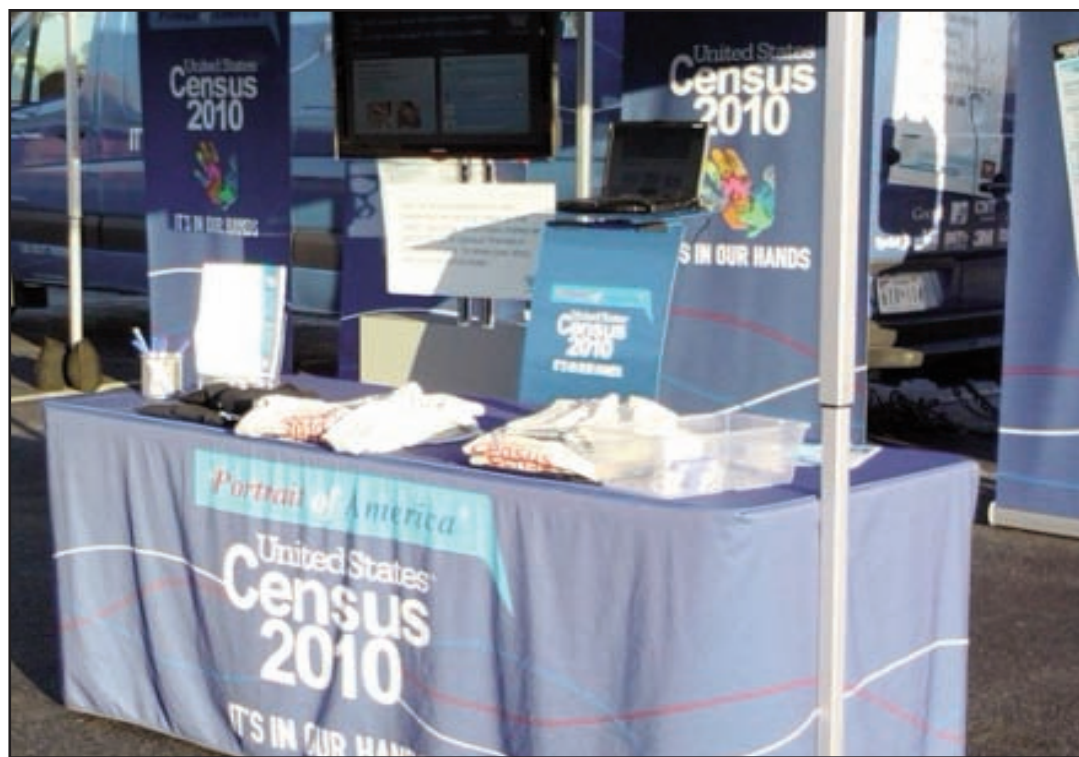
The 2010 Census road tour is a learning tool to educate people about the importance of the census.