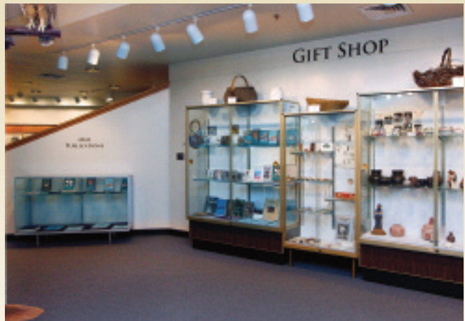
Museum Gift Shop

open Monday through Saturday from 8 a.m. to 5 p.m. For more information, call (910)521-6282 or go online to www.uncp.edu/nativemuseum . ■