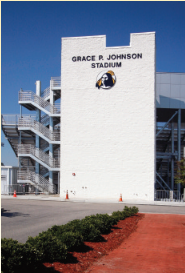
Grace P. Johnson Stadium