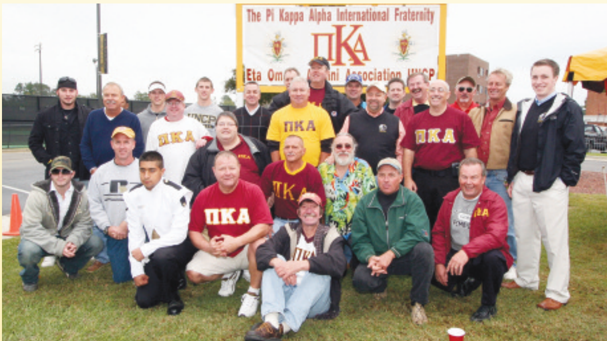
PIKES - Pi Kappa Alpha Alumni Chapter was out in force with potential pledges. About 100 attended their tailgate reunion.