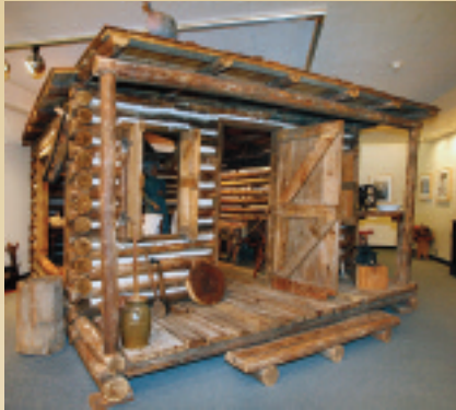
1800's Lumbee Cabin

The Native American Resource Center is pleased to announce its grand re-opening! A celebration of the re-opening took place on June 19 in the Center.