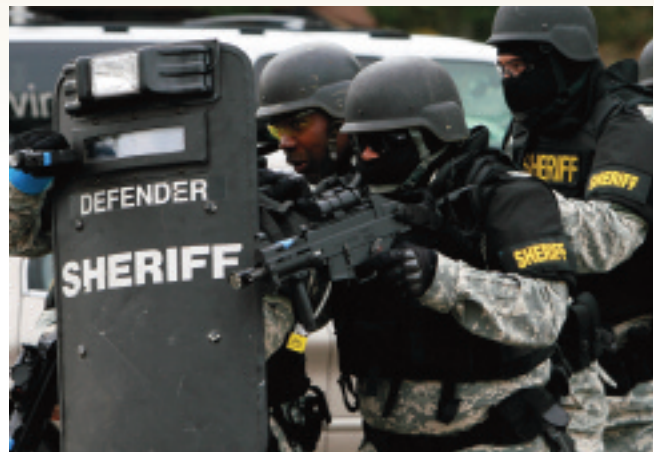
The SWAT team of the Robeson County Sheriff’s Department was on hand.

The staged hostage stand-off, with student-actors portraying themselves and a faculty member, ended through negotiations after approximately four hours. ■