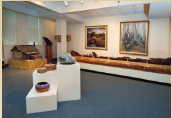
Exhibit area with 1000-year-old canoe

Plan to visit the Museum of the Native American Resource Center in Old Main when you next visit campus! The museum is