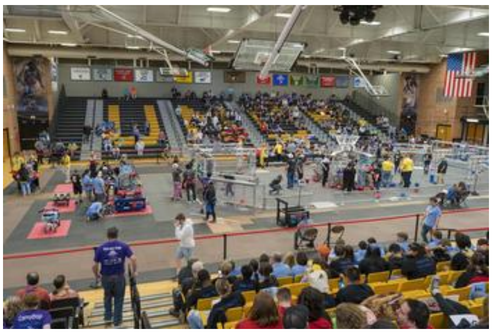
UNCP host the NC FIRST Robotics Competition on March 9-10, 2024.