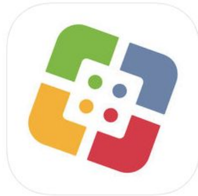
Self Service (macOS)