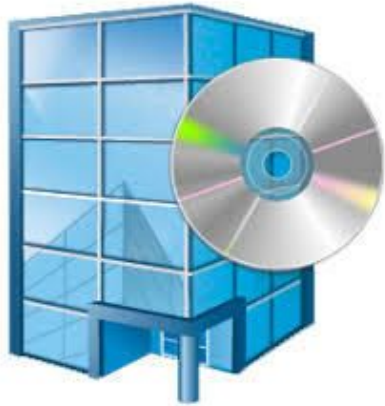
Software Center (Windows)